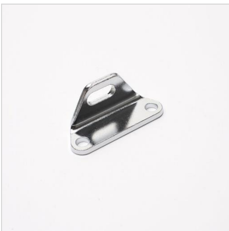
9 Bracket - Header Mount 95-08 TC