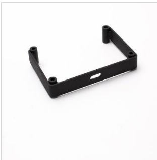
12 Bracket - Oil Pan Crossover Mount - Power Tune Duals - 95-08 TC