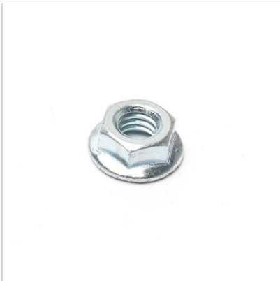
16 Nut - HSFH 5/16-18