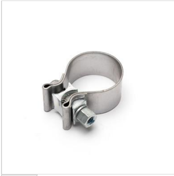
17 Muffler Clamp - 1.75" 3/8-16