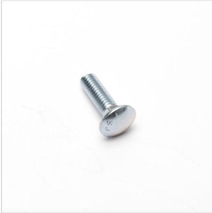
8 Bolt - RHC 3/8-16 x 1-1/4