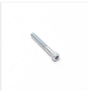
13 Screw - SHC 1/4-20 x 1-7/8