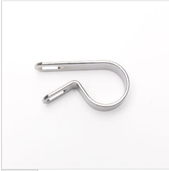
10 Clamp - Header Mount TC - chrome