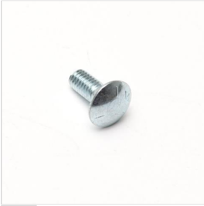
14 Bolt - RHC 5/16-18 x 3/4