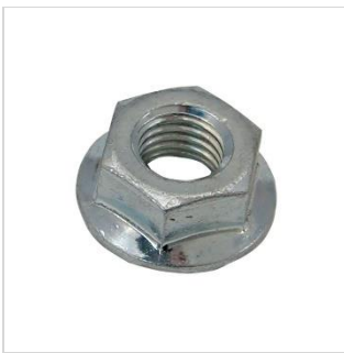
19 Nut - HSFH 5/16-24