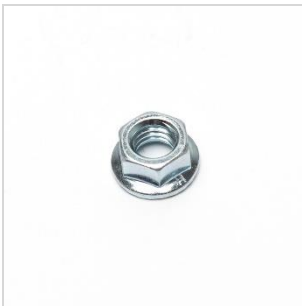
11 Nut - HSFH 3/8-16