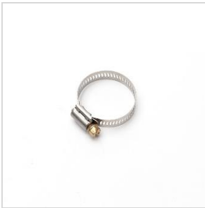
18 Hose clamp - #20