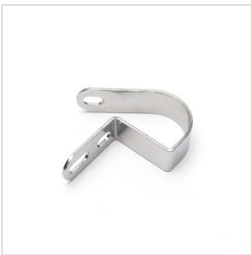
15 P Clamp - Crossover - 1995-2008